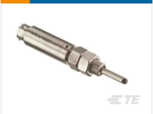
TE Part #02351008-000 GA-HD GCD-SE-500 ASSY