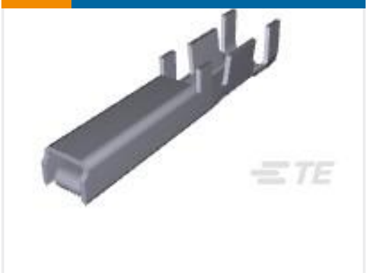
TE Part #1-917511-5 DYNAMIC D-3 REC CONT. 2L PRE-TIN L/P