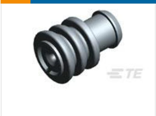
TE Part #828905-1 SINGLE-WIRE-SEAL(5MM HOLE)