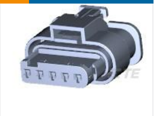
TE Part #1-1718806-1 5POS, MCON 1.2 LL REC SEALED