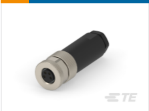
TE Part #T4010008041-000 M8,SCREW, FEMALE,S,UNSHIELD,4P, GOLD