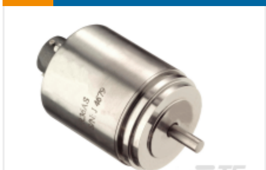
TE Part #02560927-000 R36AS 2.5KHZ +/- 30 DEG