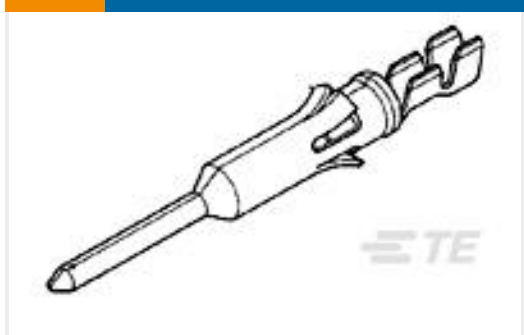
TE Part #66587-2 TYPE VI PIN,MULTI-MATE,L.P.