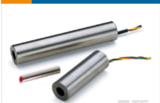
TE Part #02560392-000 LVDT HR 300 ASSY