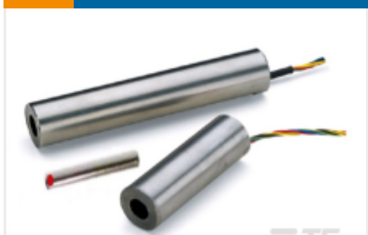
TE Part #J05562055-000 CORE 1J50 .250OD 5.60LG #6-40