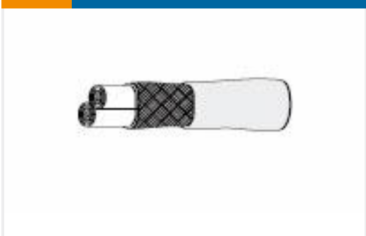
TE Part #895313-000 55A1822-22-9/96-9CS2275