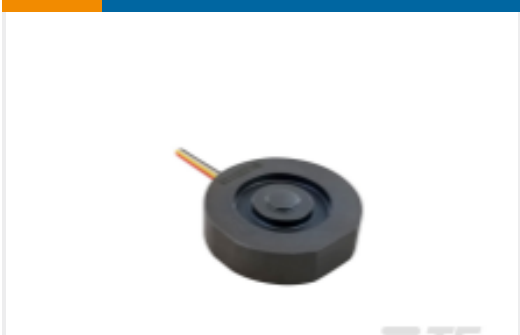
TE Part #20009605-20 FX29K0-100A-0010-L