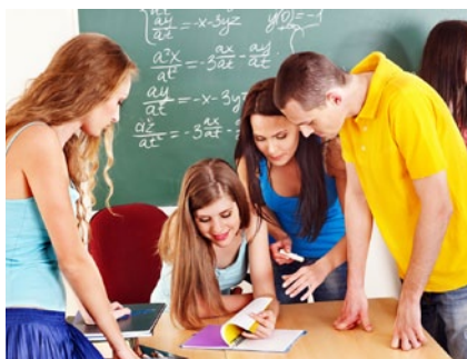
Indoor air quality