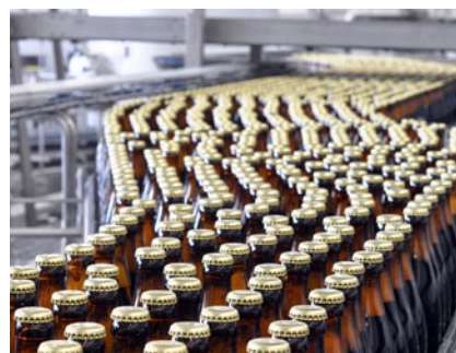
Leak monitoring in filling plants (safety)