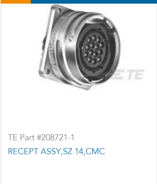
TE Part #208721-1 RECEPT ASSY,SZ 14,CMC