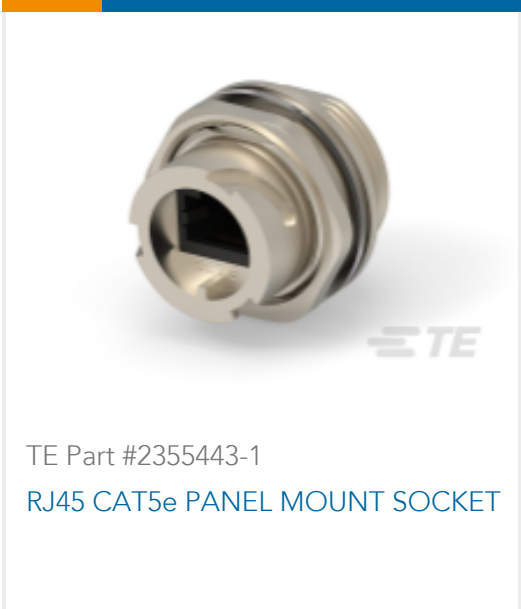
TE Part #2355443-1 RJ45 CAT5e PANEL MOUNT SOCKET