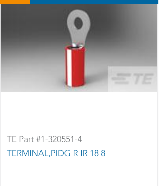
TE Part #1-320551-4 TERMINAL,PIDG R IR 18 8