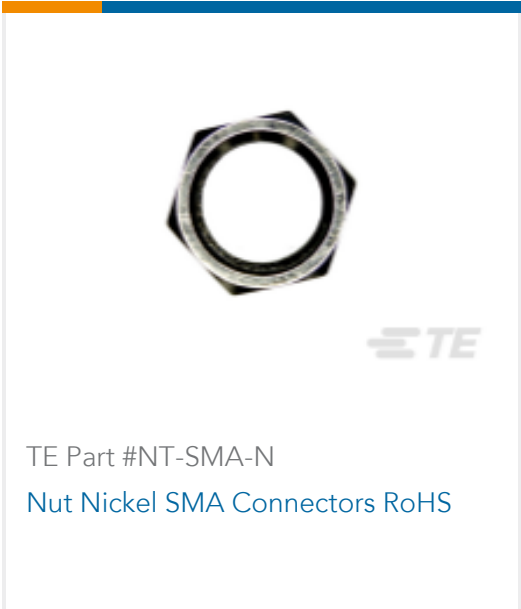
TE Part #NT-SMA-N Nut Nickel SMA Connectors RoHS