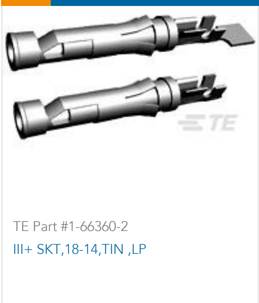
TE Part #1-66360-2 III+ SKT,18-14,TIN ,LP