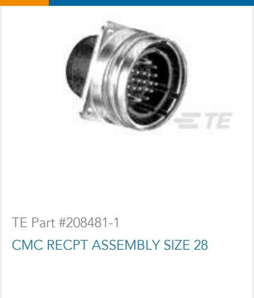
TE Part #208481-1 CMC RECPT ASSEMBLY SIZE 28