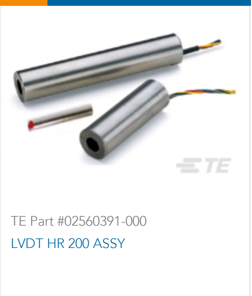
TE Part #02560391-000 LVDT HR 200 ASSY