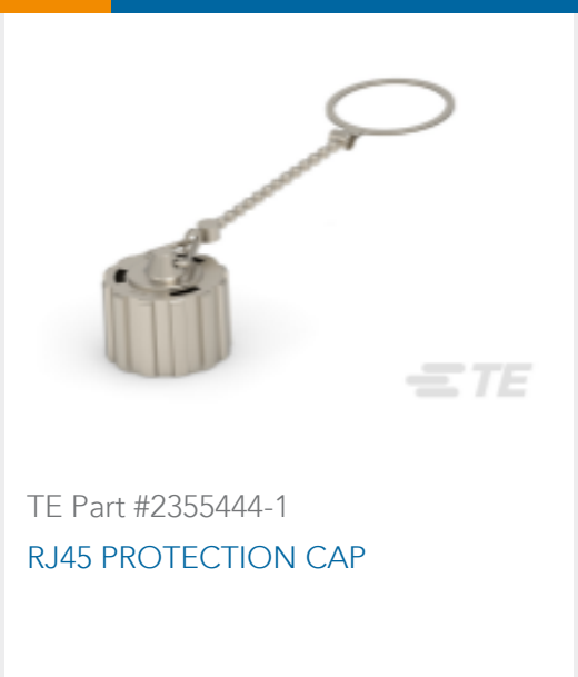
TE Part #2355444-1 RJ45 PROTECTION CAP