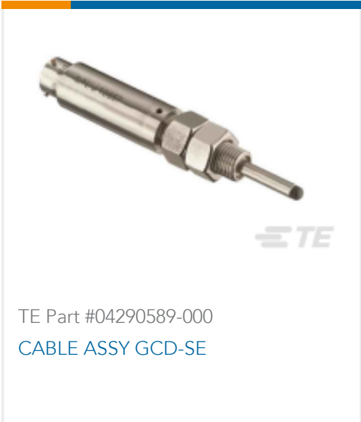
TE Part #04290589-000 CABLE ASSY GCD-SE