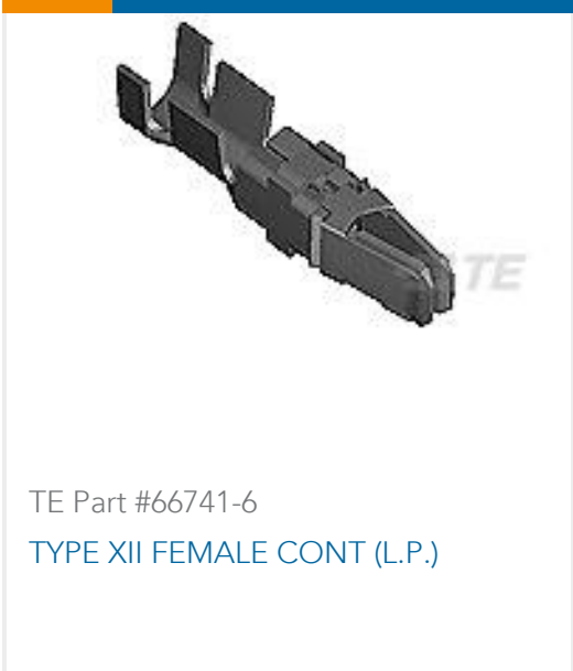
TE Part #66741-6 TYPE XII FEMALE CONT (L.P.)